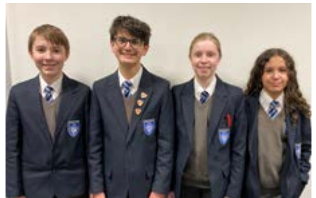
Well done to Team AGS!

They finished in 2nd place, missing out on 1st place by the narrowest of margins!