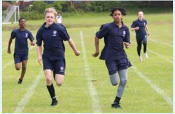
Year 8 (above and left) Year 7 and Year 10 (below)