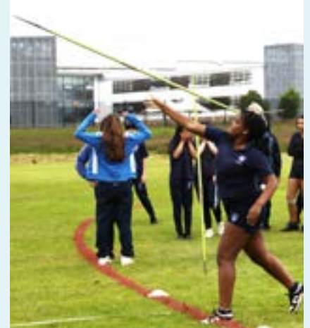
Year 9 (above) Year 8 (below and next page)