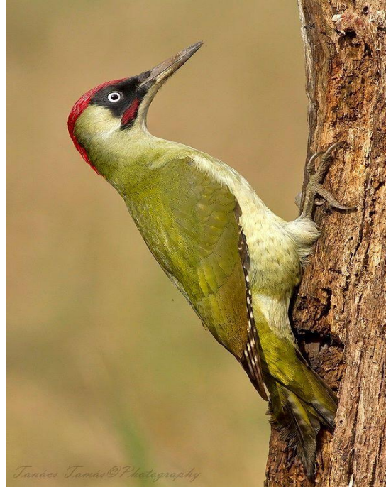
Woodpecker ( Green )