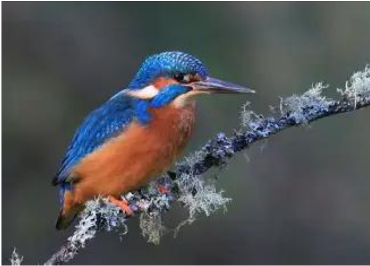
Kingfisher ( Blue )