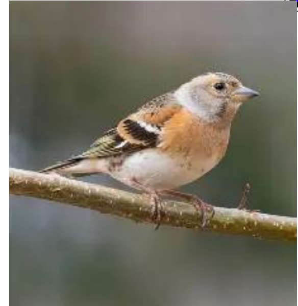
Brambling ( Orange )